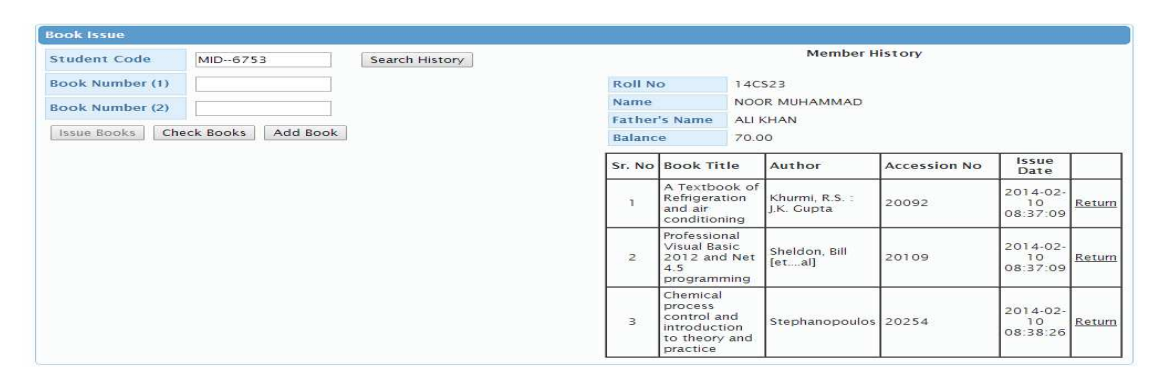
Figure 6: Circulation Process