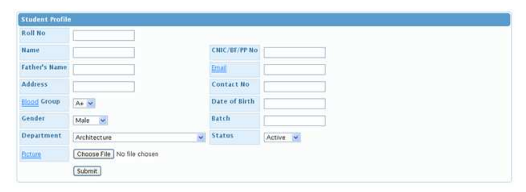
Figure 5: Membership Form

System to fill the membership form set number of organic automatically every member in defeating any rules, without the identity of the members of all other areas of liberalization on the request of members. Download the image and then member of the member card is ready to print with his / her barcode of each user's library. Card can be printed by various means and one of the multiple cards. Members enter the deposit amount to more than the minimum of services Rs. 100 (hundred) for banking services book.