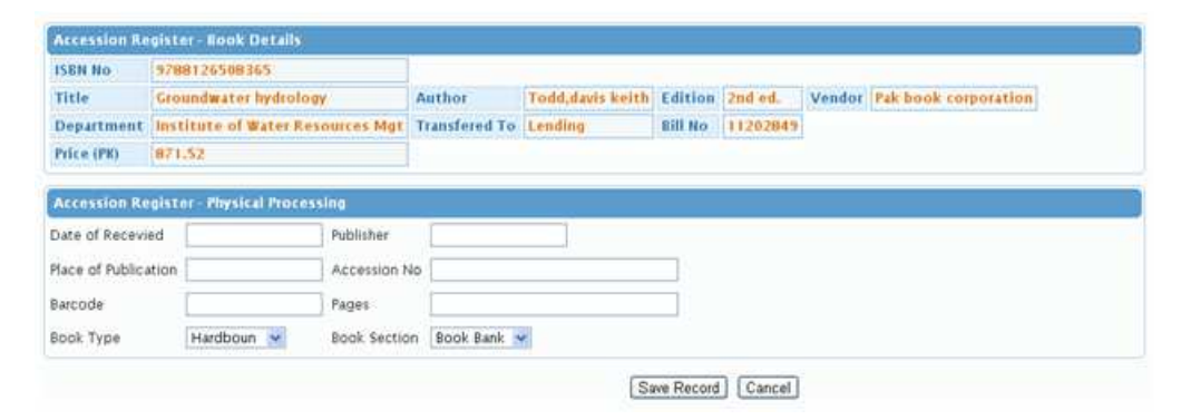
Figure 3: Acquisition-Part-Ii (Accession Register)

In physical therapy to keep a record of the automatic joining of books. In this process are not automatically assigned to join. Barcode printing information from a separate book spine slips of paper and is able to paste a sticker on the books.